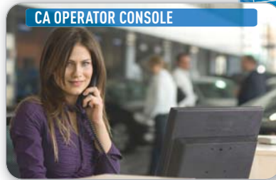
CA OPERATOR CONSOLE