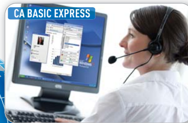
CA BASIC EXPRESS