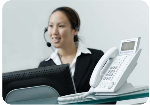
RECEPTIONIST USING COMMUNICATION ASSISTANT

Operator Console also supports the following additional options: