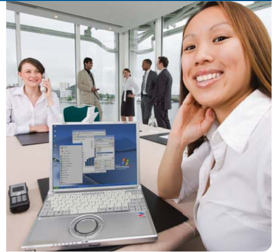
COMMUNICATION ASSISTANT BROCHURE