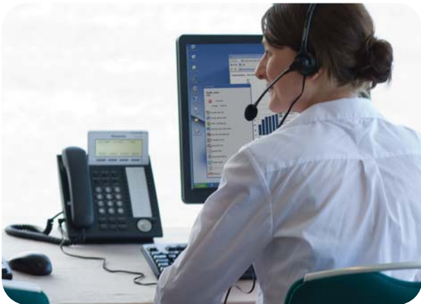
CA - PROVIDING UNIFIED COMMUNICATIONS